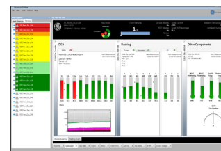
Transformer health/risk overview